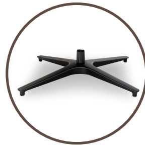
RS50-V black or chrome