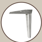
NNE black or alu

HEIGHT: 84 cm DEPTH: 97 cm SEAT DEPTH: 60 cm SEAT HEIGHT: 47 cm ARM HEIGHT: 68 cm