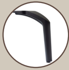
NNA black or metal look

HEIGHT: 82 cm DEPTH: 95 cm SEAT DEPTH: 58 cm SEAT HEIGHT: 47 cm ARM HEIGHT: 65 cm